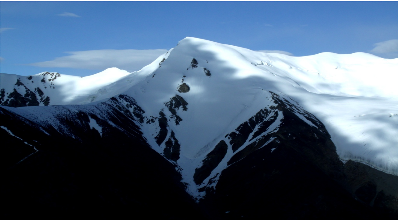
View of Minglir Sar from the summit of Koz Sar